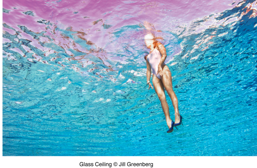
Glass Ceiling © Jill Greenberg