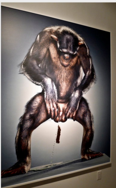
And Now For Something Completely Different , [2008]; Archival pigment print; 63.75 x 74 inches